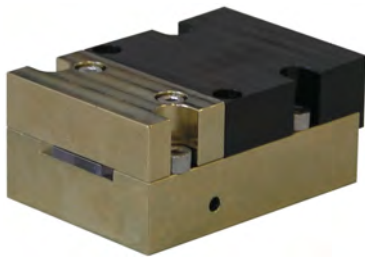
CA30 - YAG